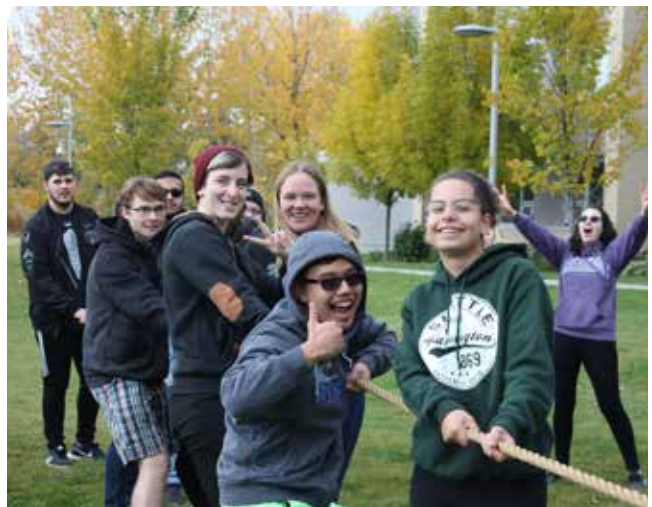
ORS - The Tug o' War