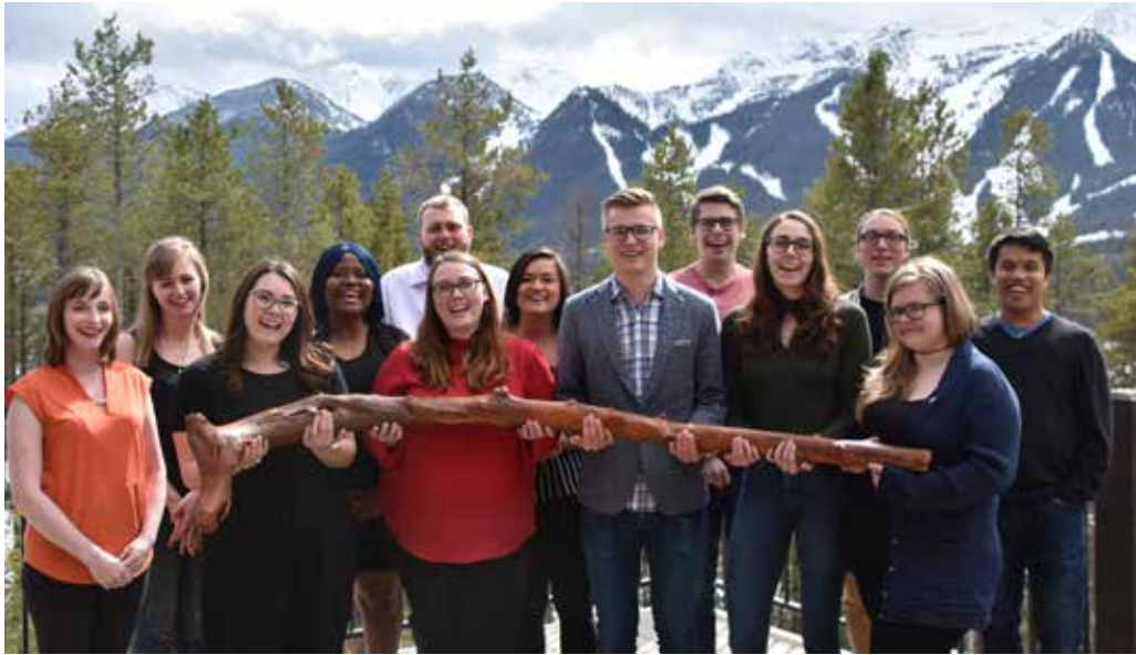
Changeover Retreat 2018