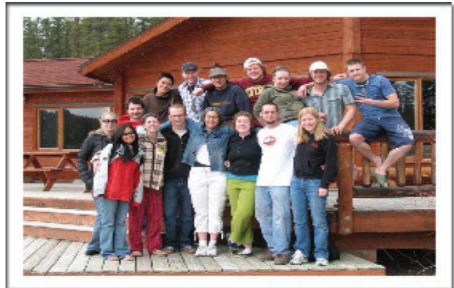
April 2007 Changeover Retreat

Health Sciences Representative Vacant International Representative Vacant First Nations, Métis, Inuit Representative Vacant